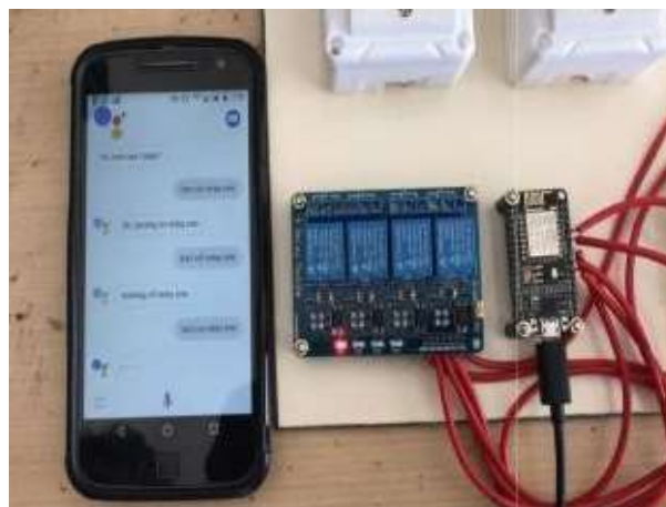
Fig.2 Voice Control, Relay On.

Figure 4 gives the detailed depiction of module 2.