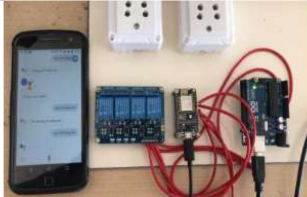
Fig.3 Voice Control - Relay Off.